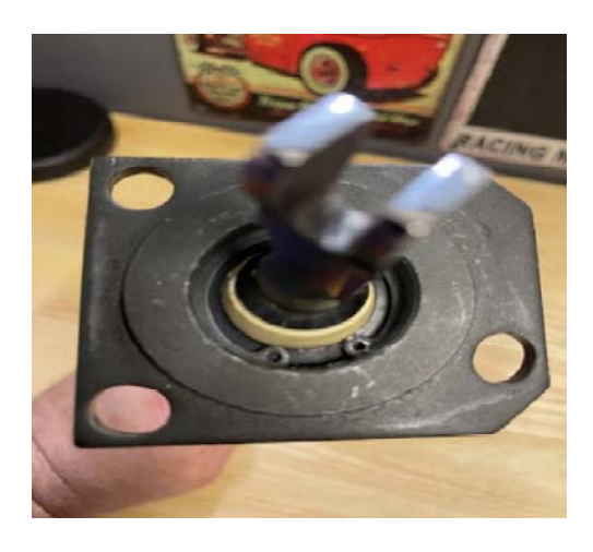
Gear Lever Saddle